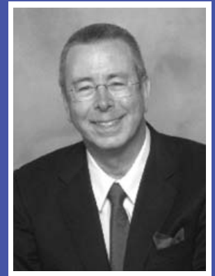
Director, The Center For Anger Resolution, Inc.